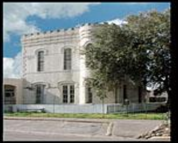
Port Lavaca, Texas Nautical Landings Marina MainStreet Theatre Old Jail House