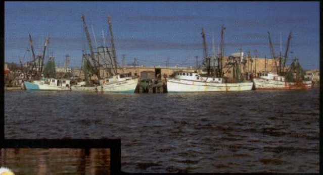
Port Lavaca, Texas