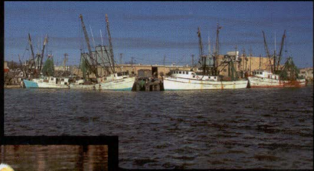
Port Lavaca, Texas