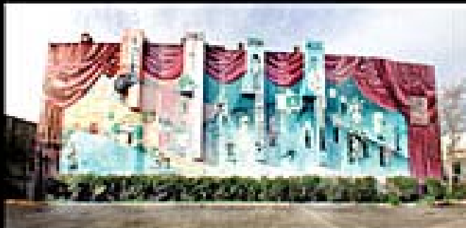
Port Lavaca, Texas Nautical Landings Marina MainStreet Theatre Old Jail House