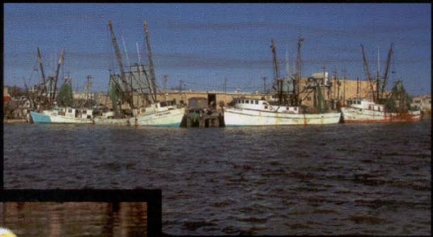
Port Lavaca, Texas