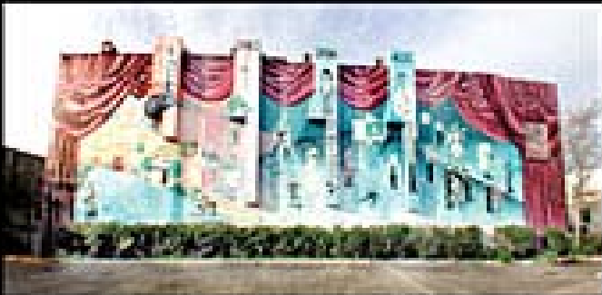
Port Lavaca, Texas Nautical Landings Marina MainStreet Theatre Old Jail House