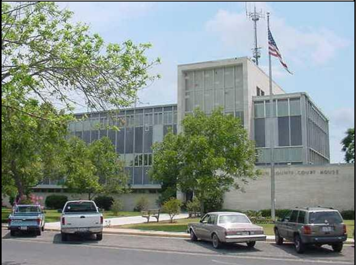
CALHOUN COUNTY COURTHOUSE

CONDENSED MONTHLY FINANCIAL REPORT-UNAUDITED AUGUST 31, 2021