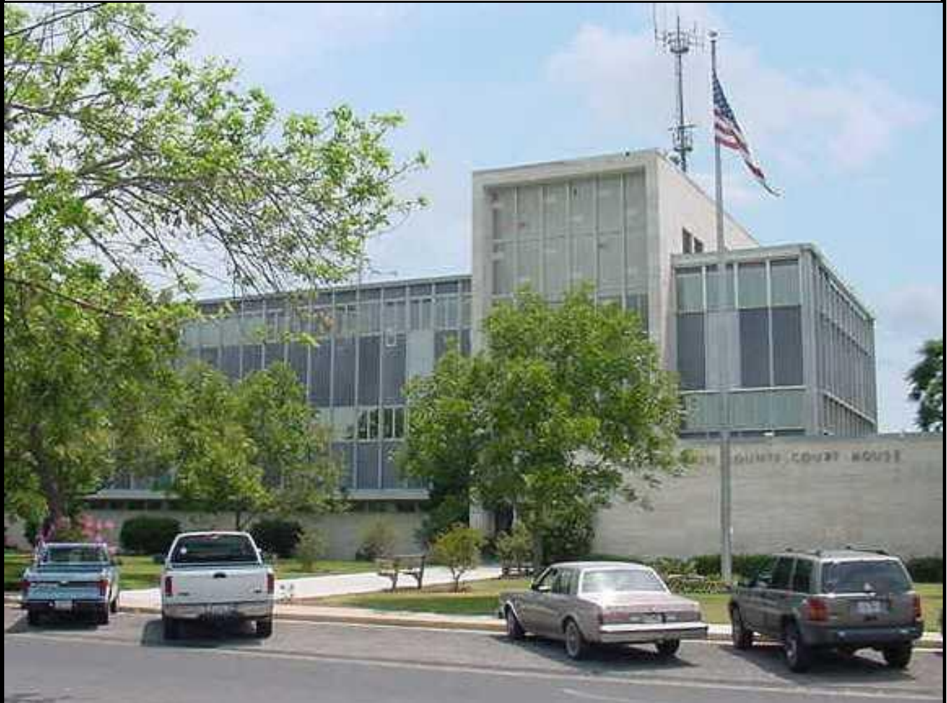
CALHOUN COUNTY COURTHOUSE

CONDENSED MONTHLY FINANCIAL REPORT-UNAUDITED FEBRUARY 28, 2021