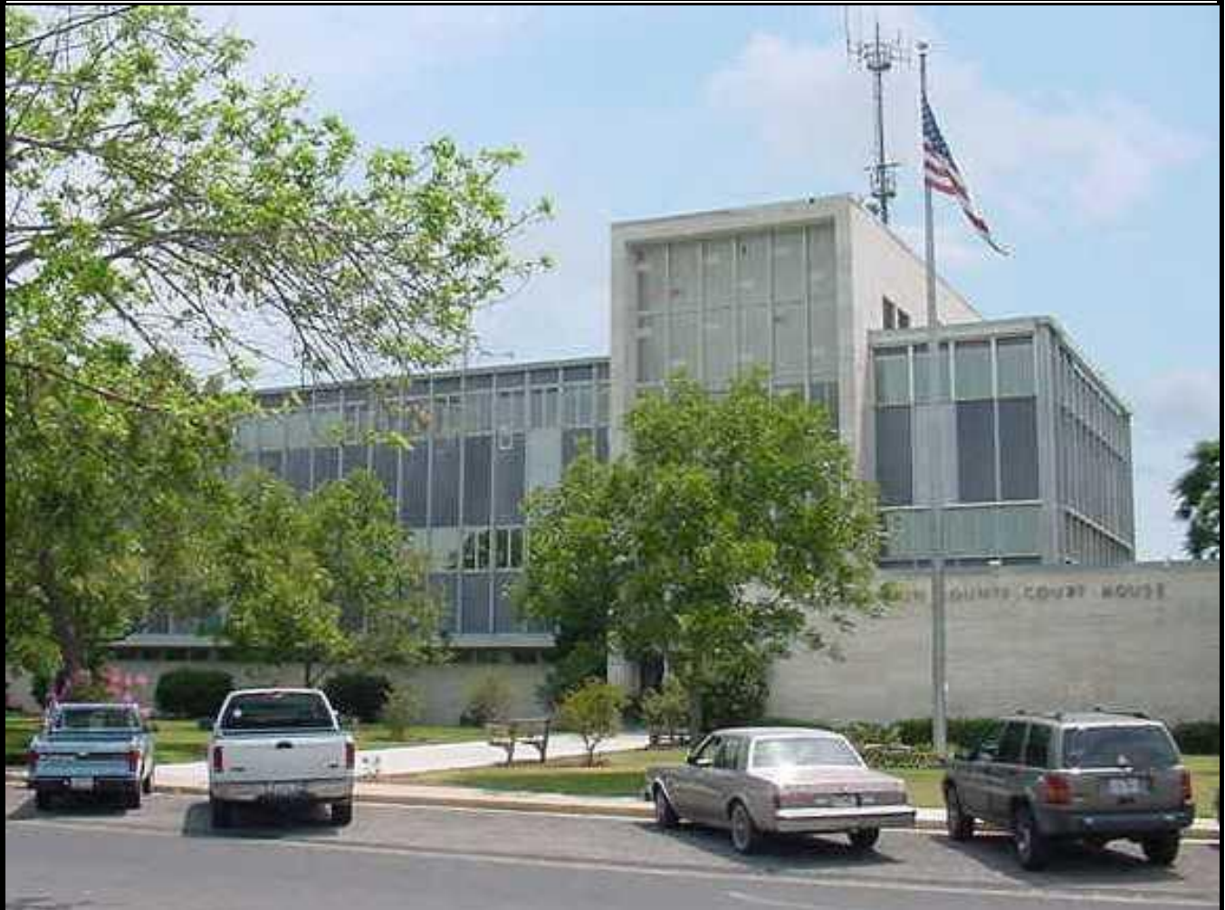
CALHOUN COUNTY COURTHOUSE

CONDENSED MONTHLY FINANCIAL REPORT-UNAUDITED SEPTEMBER 30, 2020