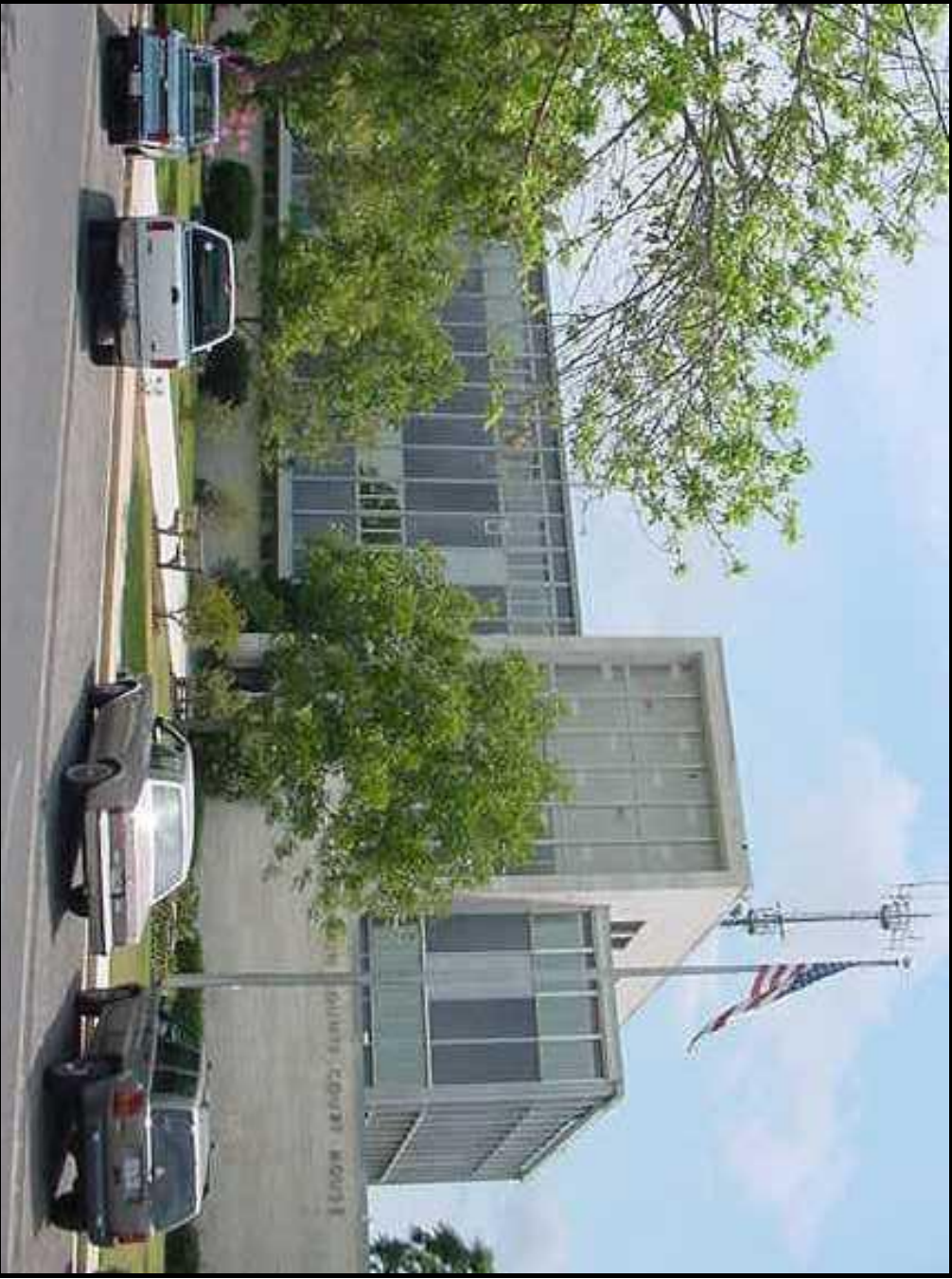
CALHOUN COUNTY COURTHOUSE

CONDENSED MONTHLY FINANCIAL REPORT-UNAUDITED OCTOBER 31, 2015