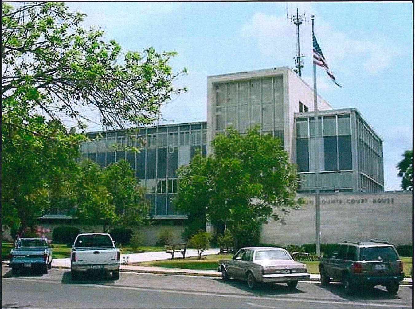
CALHOUN COUNTY COURTHOUSE

CONDENSED MONTHLY FINANCIAL REPORT-UNAUDITED SEPTEMBER 30, 2015