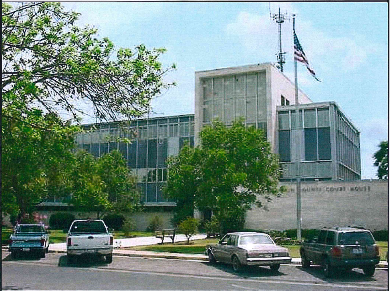
CALHOUN COUNTY COURTHOUSE

CONDENSED MONTHLY FINANCIAL REPORT-UNAUDITED AUGUST 31, 2015