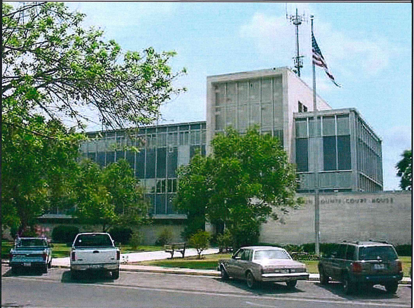
CALHOUN COUNTY COURTHOUSE

CONDENSED MONTHLY FINANCIAL REPORT-UNAUDITED JULY 31, 2015