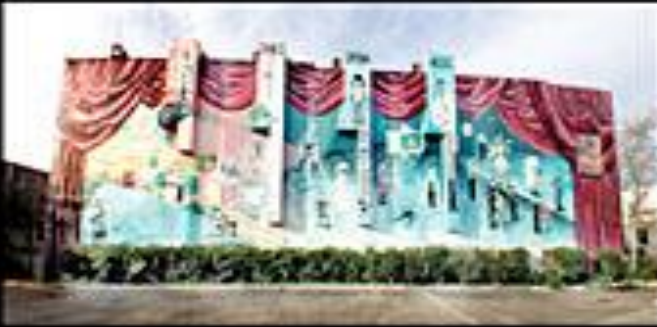
Port Lavaca, Texas Nautical Landings Marina MainStreet Theatre Old Jail House