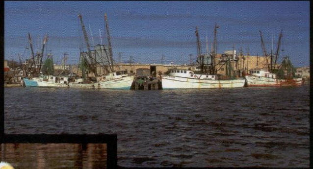
Port Lavaca, Texas